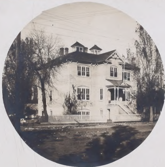
NEW JERSEY ACADEMY LOGAN UTAH